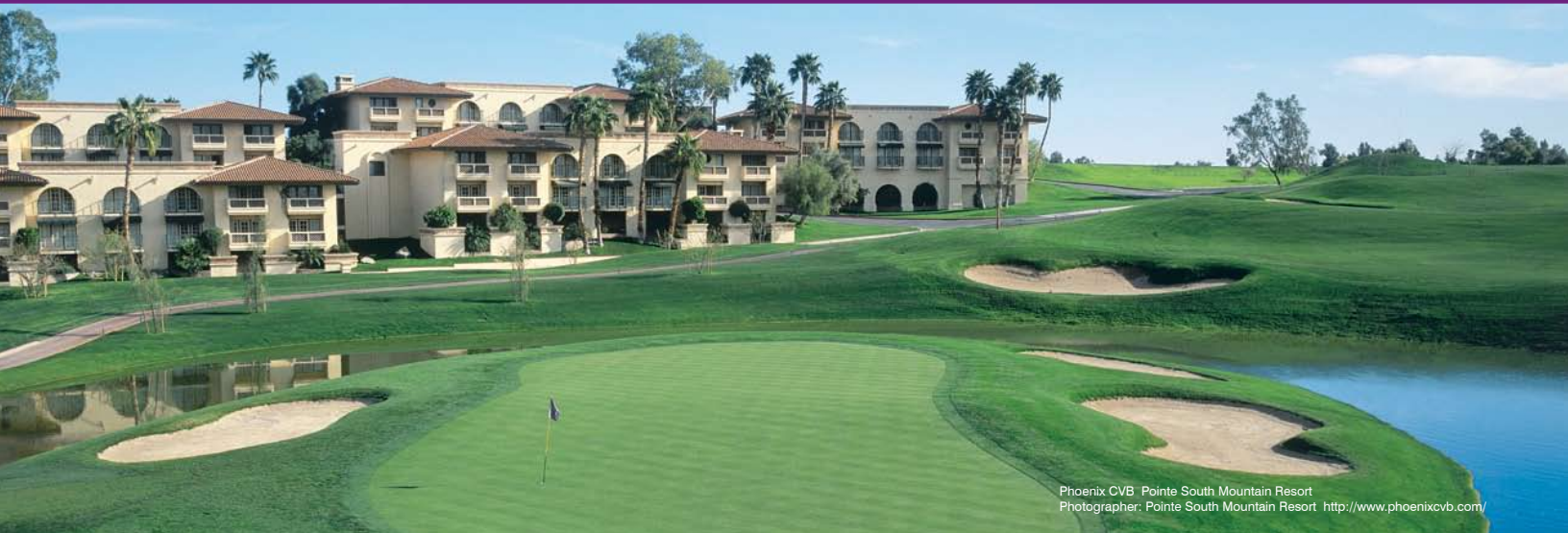
Phoenix CVB Pointe South Mountain Resort Photographer: Pointe South Mountain Resort http://www.phoenixcvb.com/

Monday, 3 December - Wednesday, 5 December Arizona Grand Resort Phoenix, Arizona USA